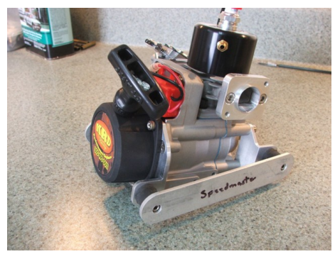
Step 2 • Place drill plates on both sides of motor.