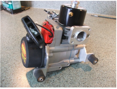
Step 1 • Place supplied rubber isolators on motor mounts.