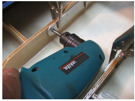
Step 6 • Drill holes as shown.