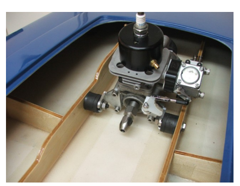
Step 8 • Install your motor.