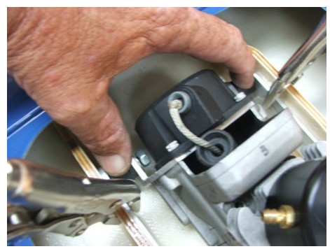
Step 5 • Loosen all 4 nuts on mounts. Hold down on front isolators while lifting front of motor.