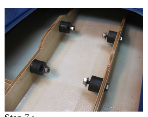
Step 7 • Install rubber isolators. Note: Don't forget to seal the holes in the wood with thin CA